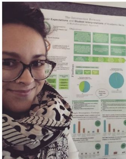
Me + My Poster

Earlier in October, I attended ECIL 2016 (European Conference on Information Literacy). I really enjoyed the opportunity to share my own research with an international audience.