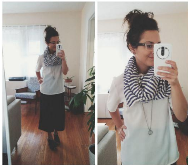
Striped Scarf #whatthelibrarianwore

"Because I'm the kind of girl who fantasizes about being trapped in a library overnight."