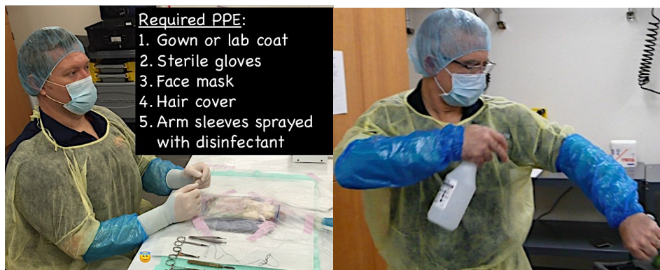
Figure 7. Required surgeon personal protective equipment.