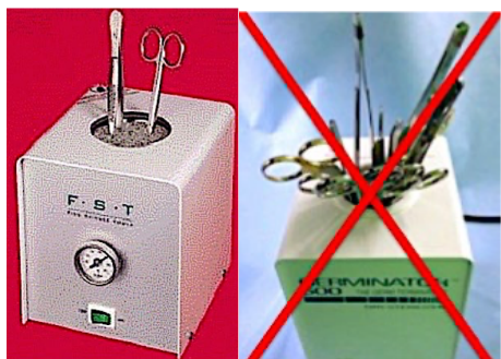
Figure 4. Proper use of the bead sterilizer