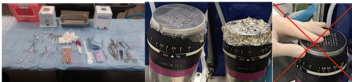
Figure 5. Maintaining asepsis during surgery: ideally, the bead sterilizer and sharps bin should be more distant from the sterile surgical instruments.