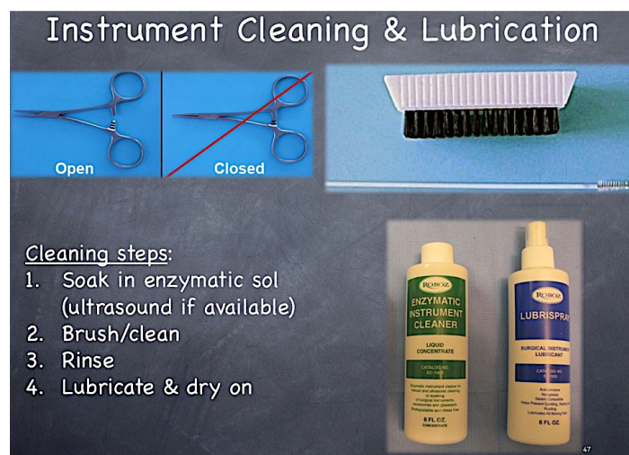
Figure 2. Instrument cleaning and lubrication