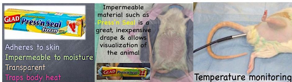
Figure 6. Equipment to maintain body temperature and sterility. If there is a separate surgeon and anesthetist, the Press'n Seal drape can be placed so that the left hind foot is exposed for adjusting the pulse oximeter and testing the withdrawal reflex.