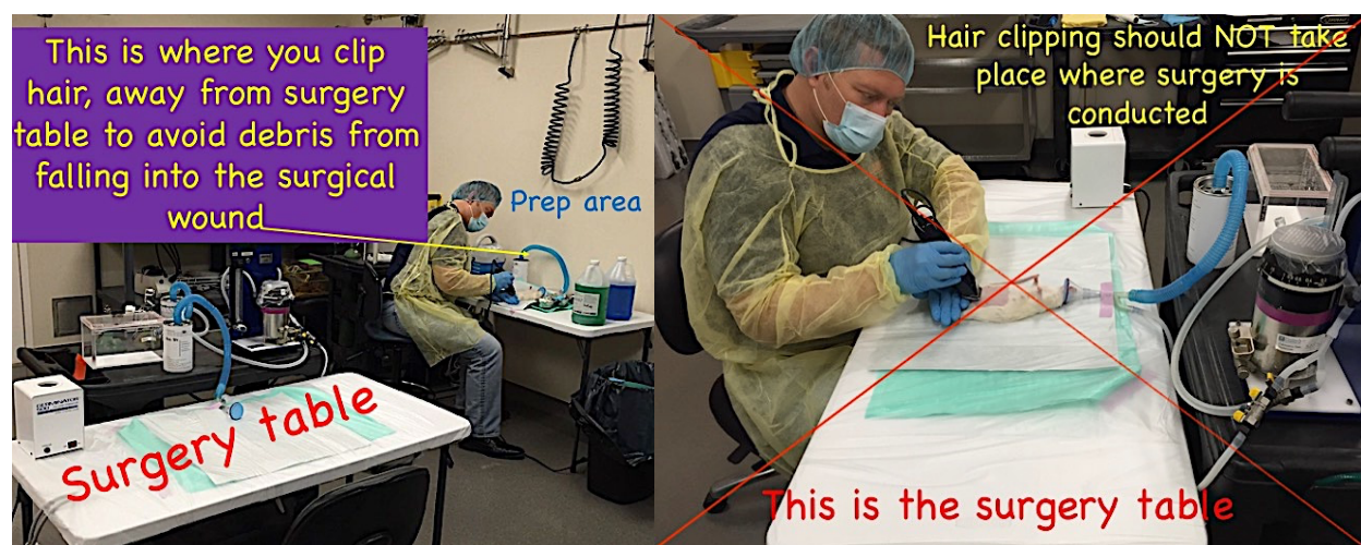
Figure 1. Separation of the surgery table and prep area. Note that the surgeon is wearing mask, bonnet, and EXAM gloves for prep, but not disinfected arm sleeves and surgical gloves. A